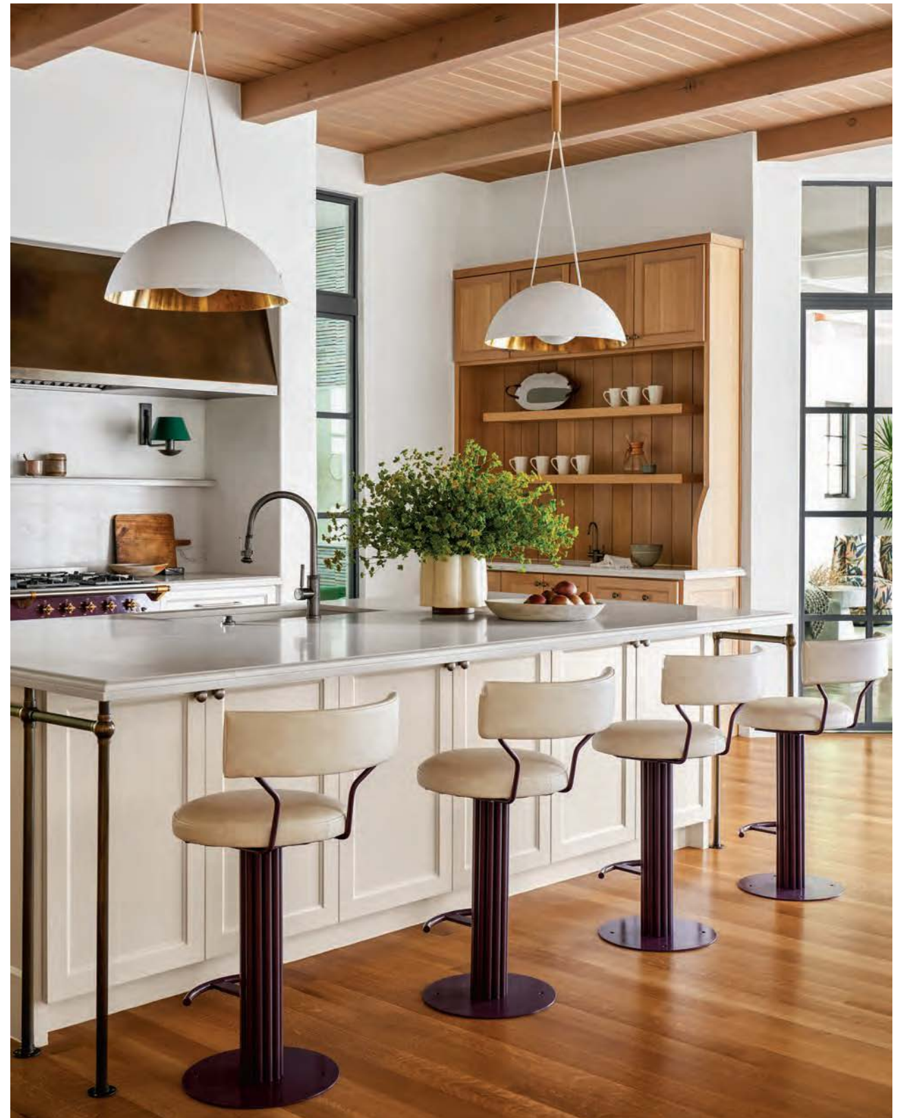
Above: Swivel barstools highlight the kitchen island with Caesarstone's honed Statuario Nuvo countertop and a Waterstone faucet, above which hang pendants from Allied Maker. Below a burnished-brass hood fabricated by Orona is a Lacanche range.