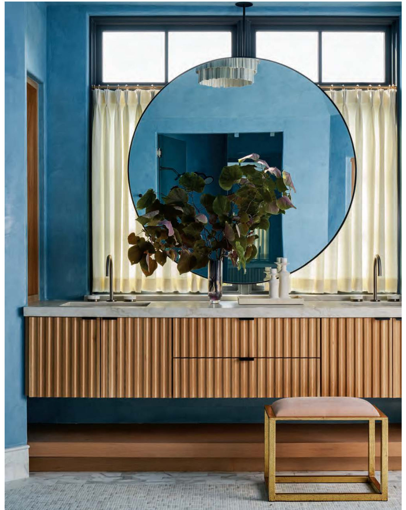
Above: The primary bathroom's American Clay plaster walls don a custom blue paint. A Mr. Brown London bench from C. Maddox & Company pulls up to a vanity equipped with Watermark faucets. The mirror was fabricated by Glasshouse.