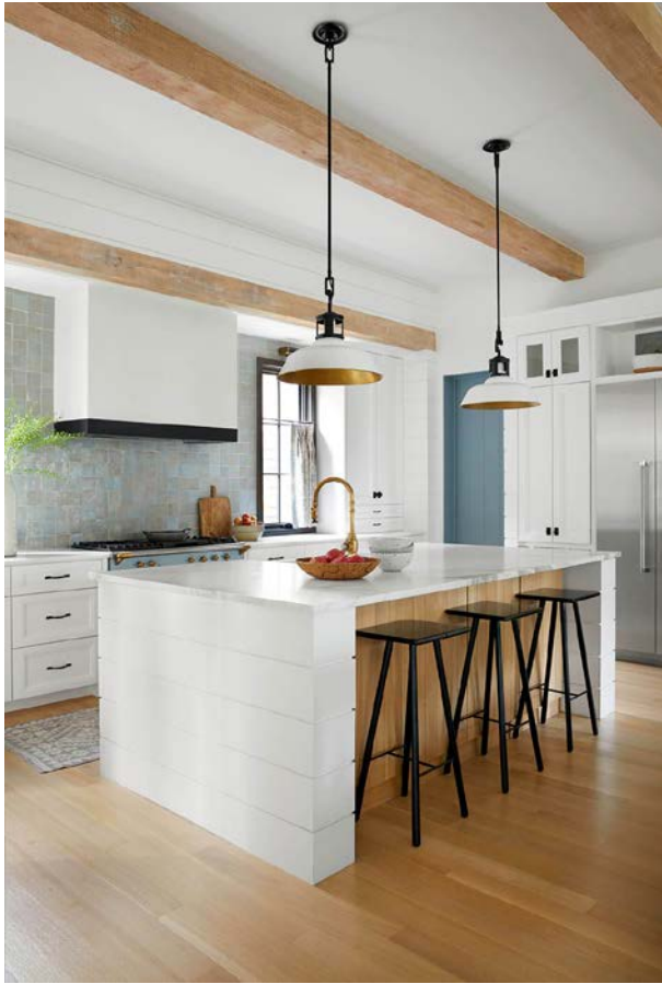
With hand-hewn Douglas fir beams and rift-sawn white oak hardwood floors, the kitchen incorporates natural materials with modern appliances. Additionally, an unlacquered brass faucet by Waterstone and a backsplash by Clé Tile offer standout details.