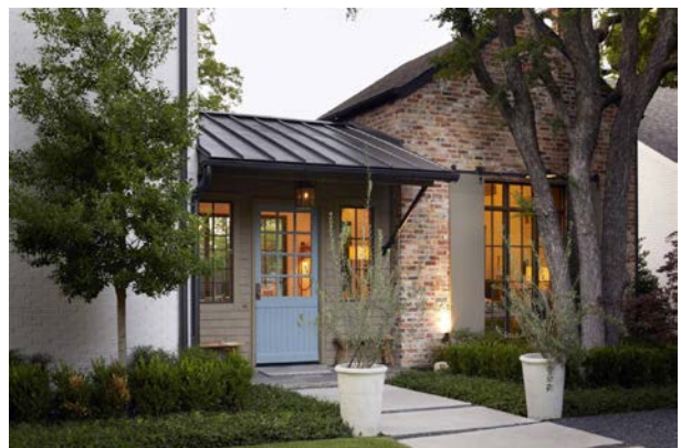
A combination of materials — such as lime-washed brick and cedar shake — makes for a dynamic exterior.