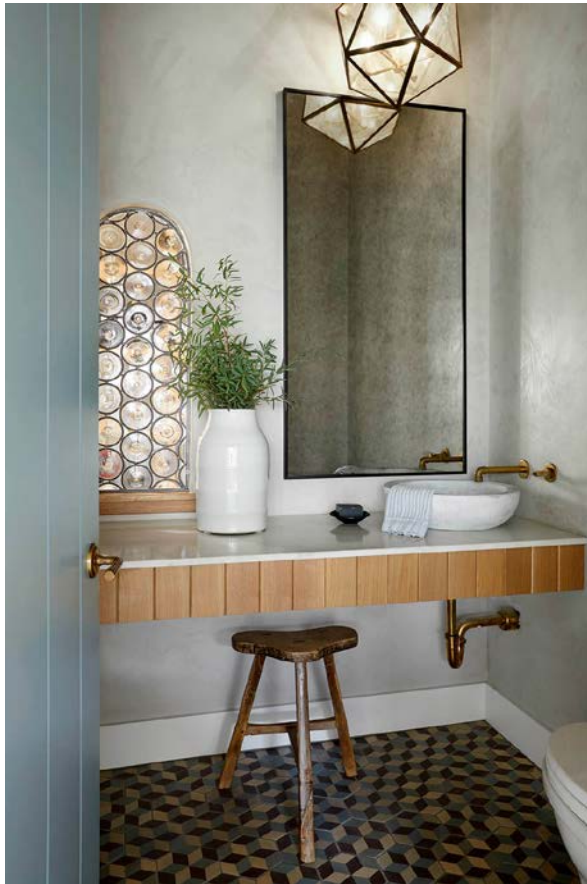
This moody and wonderful powder room has a charming mock window and antique French flooring from Chateau Domingue out of Houston.

Designed to make use of a variety of materials (one of this year’s prominent design trends), the home’s exterior is flanked by live oaks and potted olive trees. “We were able to have a lot that has a bit more width for this area of town,” Erin tells us, “so I wanted to create something that wasn’t all two-story. I wanted it to be a little bit more approachable. That perspective from the street of having a small courtyard of trees as you pull up was a priority for me.”