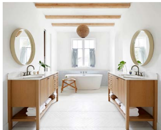
"We designed the master suite to really flow," says Erin. "It has two entrances and a strong connection to the bedroom, so it all kind of lives as one." The master bathroom is shown here, complete with a freestanding tub and custom white oak vanities.

In the primary bedroom, a fixture from Oly Studio offers a whimsical focal point. "It's a flock of birds, and it's such an interesting thing to look up at every evening!" says Erin. Other standout features include vintage cabinets sourced from Juxtaposition Home in California and custom lamps from a maker in Roundtop, TX. Pale pink chairs add tranquil warmth, as does the custom-made quadrille bedding.