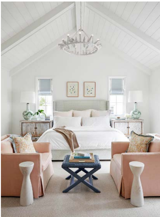
Vintage cabinets, custom lamps, and a beautiful avian light fixture from Oly Studio round out the master bedroom.

In the master bath, custom white oak vanities add a natural element, while hand-cut limestone floors bring in a dose of character. "We laid it in a pattern that I drew," Erin explains, "and then interspersed this tiny blue celeste marble mosaic. The blue celeste is what's behind that freestanding tub as well."